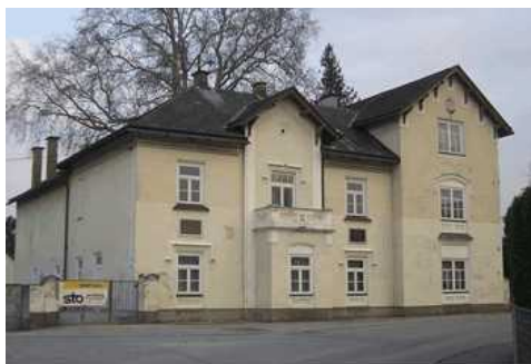
Home in Loosdorf, where the children were born (6)

To achieve the goal we will need to engage a dramaturg/writer to aid in bringing the story together and creating a framework in which we can work. A stage and costume designer, a technical crew led by a project mapping expert but also technicians, stage managers and an assistant director, costume assistants, and a hair and make up team of two or three will be needed. Ideally, the entire project would happen in an indoor space to ensure as many performances as possible and to get the best out of the technical possibilities.